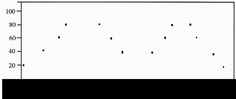
Fig. 2. Transferring the points on to the profile graph.

After marking these points, set the paper strip along the bottom of the graph and transfer the points to the graph. Then connect the points to produce the profile.